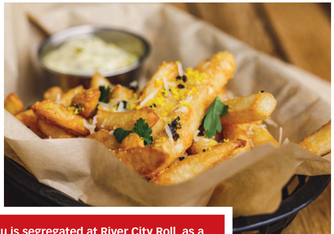
Solids and Liquids: That's how the menu is segregated at River City Roll, as a creative food-and-beverage program encourages socializing and repeat visits.